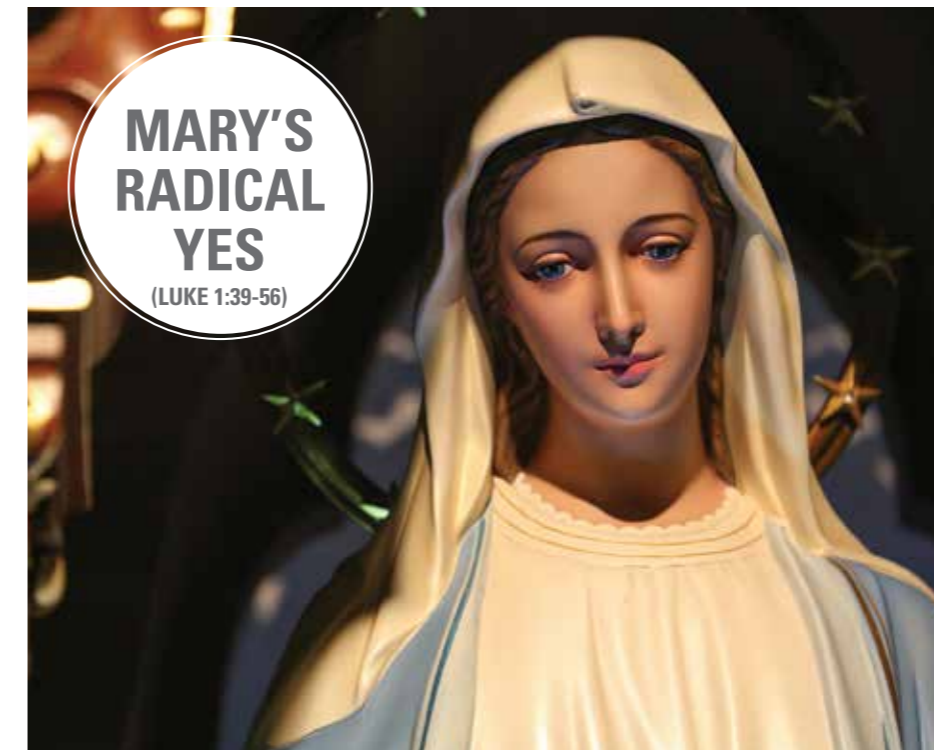
Statue of Virgin Mary, Our Lady of Grace

In today's Gospel we hear Mary's Magnificat. It is a joyful hymn of praise to God who has not forgotten his lowly handmaid and has done such great things for her.