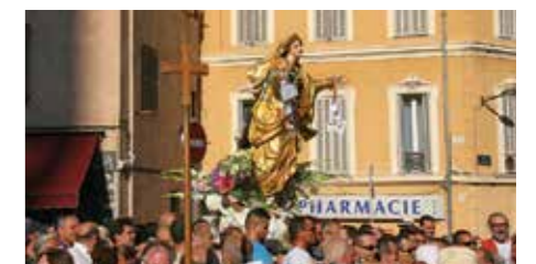
The statue of the Virgin Mary is escorted during the annual Assumption procession in the Le Panier district of Marseille, France.

Today we celebrate the feast of the Assumption of Mary. We celebrate our belief that Mary was taken up, body and soul, into heaven, where she enjoys eternal life in the company of her son. It is a joyful feast for us Christians because it points to what we believe will be our destiny. We believe that what God has done for Mary, God will do for us also; that at the end of time God will raise our mortal bodies and bring us into the fullness of God's life for ever.